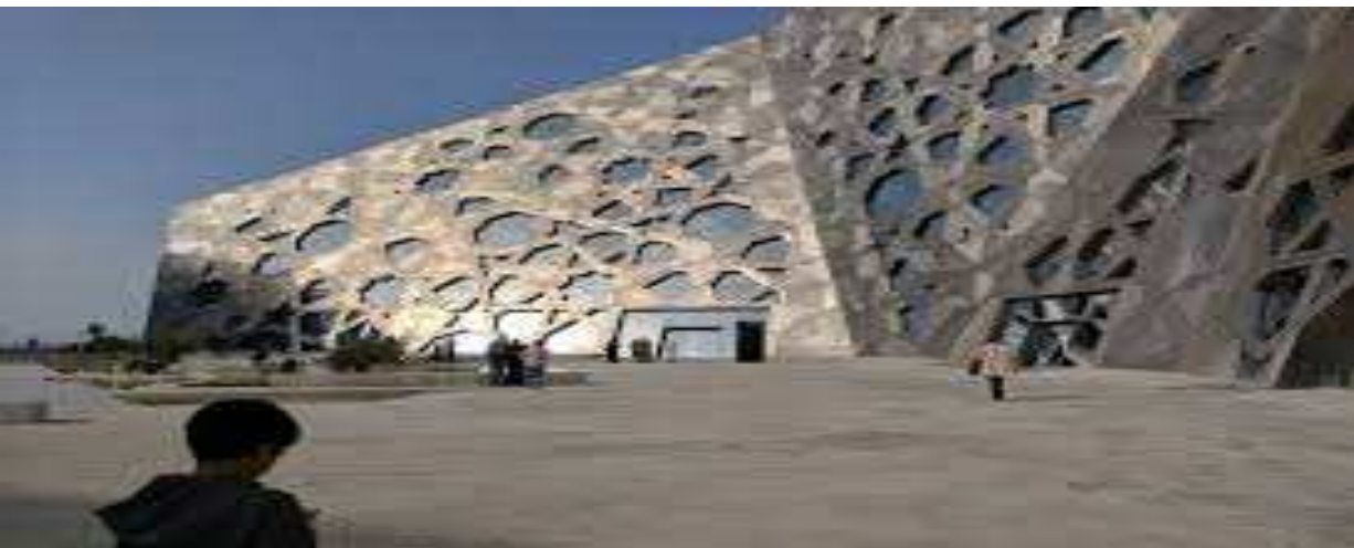
Jaber Al-Ahmad Cultural Centre