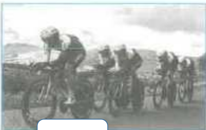
to go cycling.