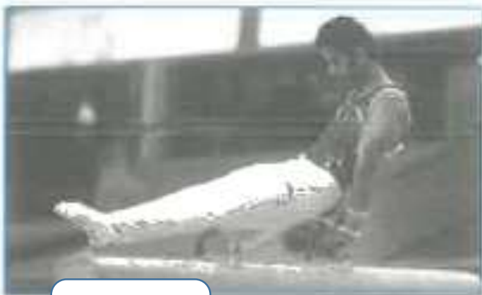
to do gymnastics.