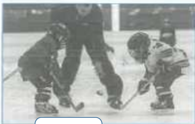
to play Hockey.