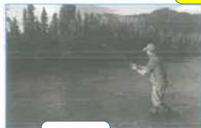
to go fishing.