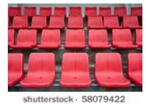
shutterstock · 58079422