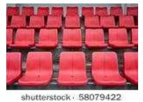
shutterstock · 58079422