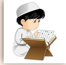
(read – Quran)