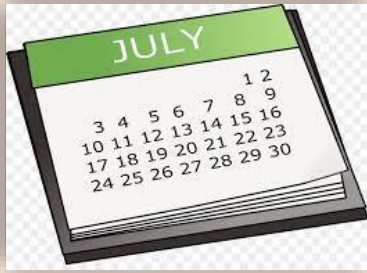
(Ramadan – month)

Write a short paragraph of three sentences using guide pictures and words about (Ramadan):