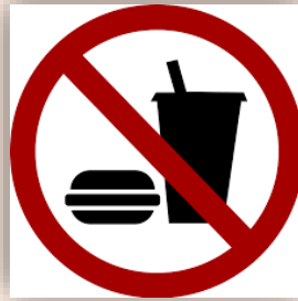
(people – fast)